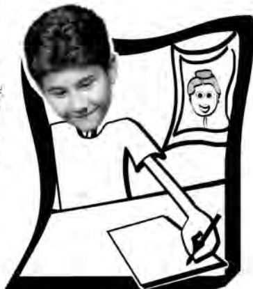
Write a letter to Grandma.