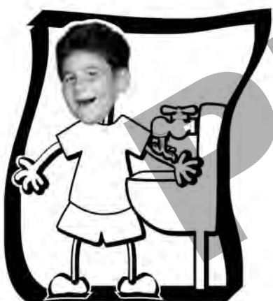
Cool the burn in cool water.