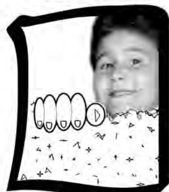
Climb a mountain.